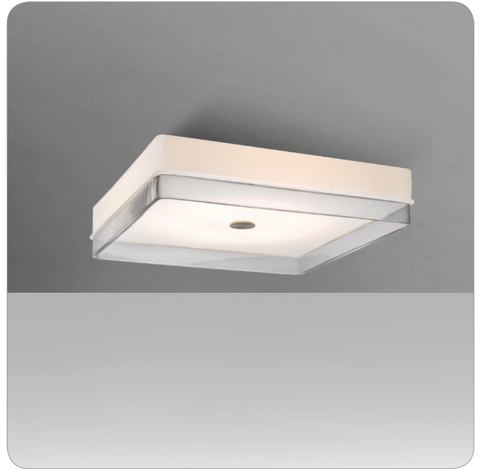
OPAL GLOSSY/CLEAR (BOXERCLC-LED)

UL or ETL Listed. Suitable for Damp Locations (interior use only).